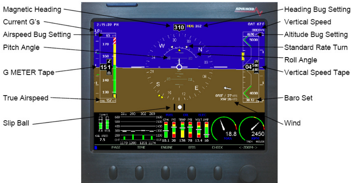
Advanced Flight Systems

whole lot more busy. The subsequent pictures show how the other manufacturers that we heard from in the last article display the same kind of data.