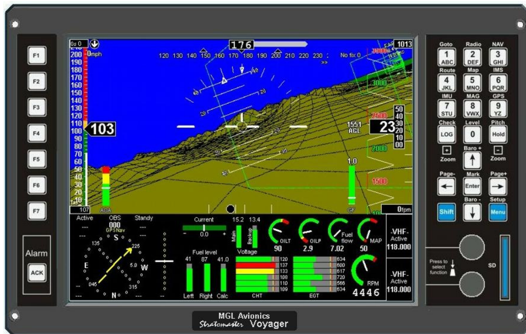
MGL Avionics Voyager