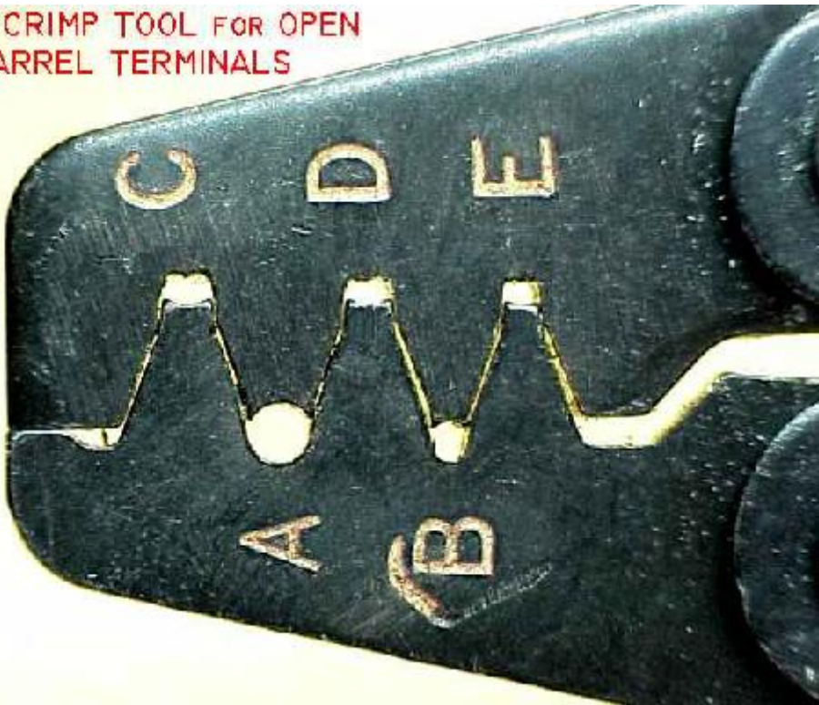
OBC-1 CRIMP TOOL FOR OPEN BARREL TERMINALS

Closeup of the business end of our Open Barrel Terminal Crimp Tool. Note that pockets "C", "D" and "E" have "butt-cheeks" formed into the upper surface. These pockets cause the end of wire grip wings to curl over and dive into the approximate center of the wire strands. Pockets "A" and "B" have a smooth, circular shape used to shape the terminal's insulation-grips into a "bear hug" . . .